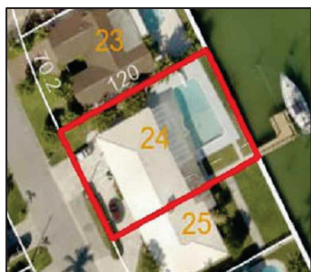
AERIAL PHOTOGRAPH (MAY NOT SHOW LATEST IMPROVEMENTS) (NOT-TO-SCALE)

CENTER LINE OF 6th STREET EAST AS N27° 34' 00"W ALL BEARINGS SHOWN HEREON REFERENCED THERETO.